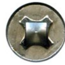
Square Phillips Combo Drive